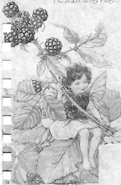
The Blackberry Fairy