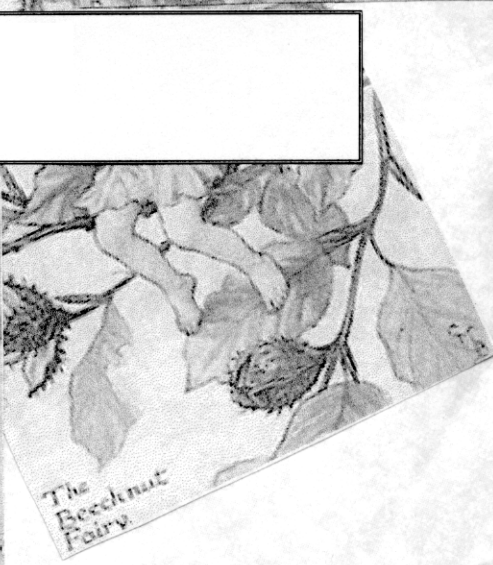
The Beechnut Fairy