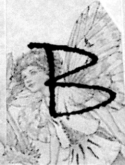
The Antisease Fairy