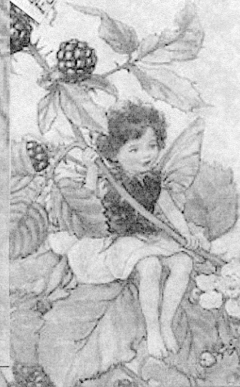
The Beechnut Fairy