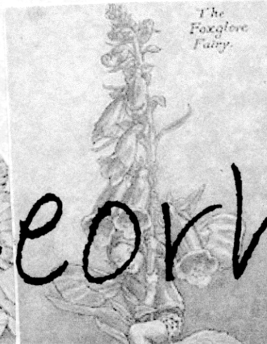
The Foxglove Fairy