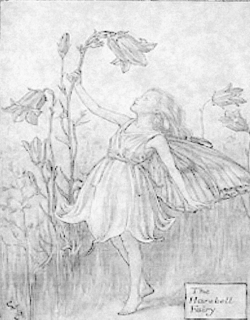
The Harebell Fairy