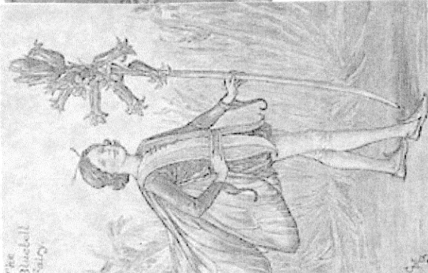
The Bluebell Fairy