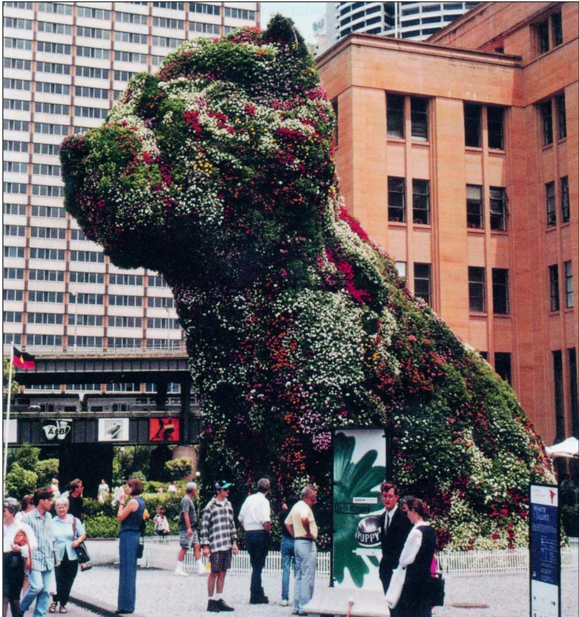
Plate 3: Photograph of audience viewing Jeff Koon's installation, Puppy , 1996, steel, live flowers and soil, 12 \times 2.5 \times 6.6 m, in front of the Museum of Contemporary Art, Circular Quay, Sydney.