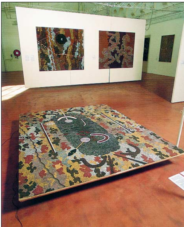
Plate 6: Photograph of exhibition East to West: Land in Papunya Tula Painting , including artworks by Clifford Possum Tjapaltjarri, Tandanya Aboriginal Cultural Institute, South Australian Museum, 1990.