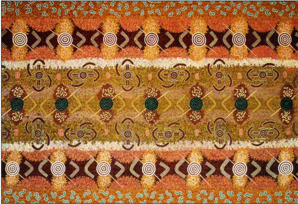
Plate 5: Clifford Possum Tjapaltjarri, b.1932, Australia, (Anmatyerre group), Yinyalingi (Honey Ant Dreaming Story) , 1983, painting, acrylic on canvas, 244 × 366 cm.