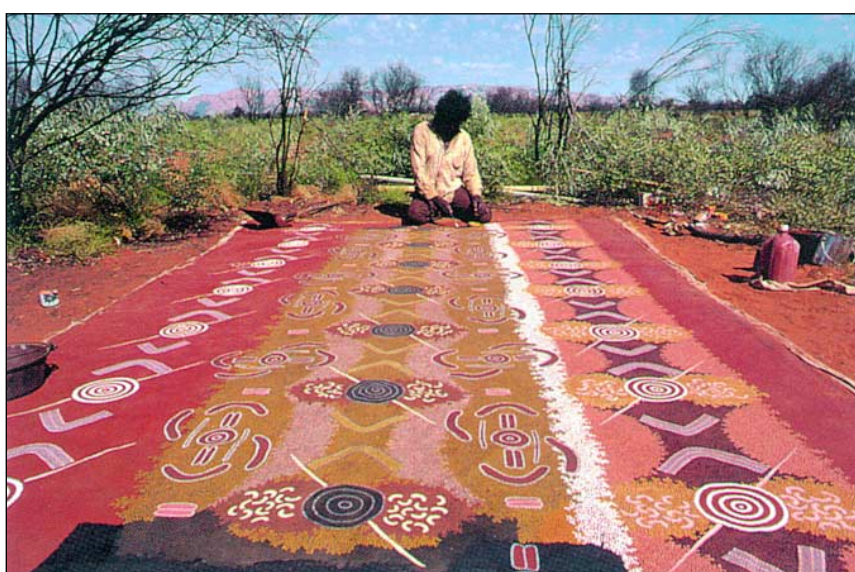
Plate 4: Photograph of Clifford Possum Tjapaltjarri painting Yinyalingi (Honey Ant Dreaming Story) , Kintore, Northern Territory, 1983.